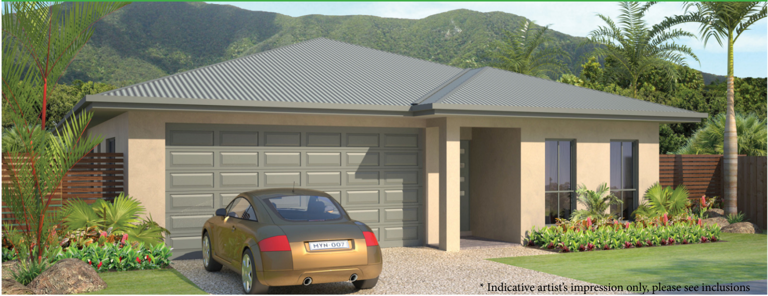
* Indicative artist's impression only, please see inclusions

Lot 421 Muirhead St. Riverstone Hills $376,900 *